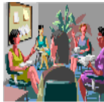
Book clubs are fun!